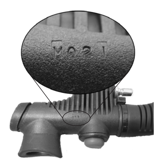
Fig. 2 - Serial number stamp

If you have a spiral hose that falls within the serial number range, please have the hose replaced by this authorized Aqua Lung retailer.