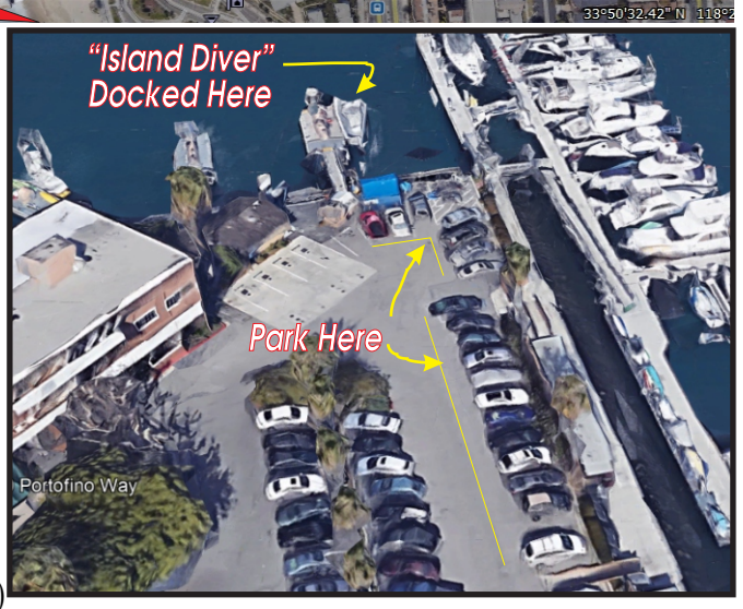
DOCK. PARKING IS ALONG THE EAST SIDE OF THE LOT CLOSEST TO THE MARINA

The "Island Diver" provides Snacks & Drinks. Tanks & Weights are Included if Pre-Booked with shop.